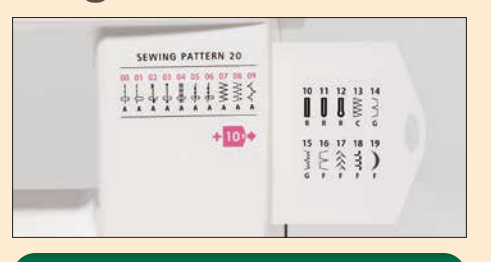
Stitch Chart Drawer

The large, easy to read LCD Screen allows for quick selection of patterns, as well as width and length adjustment.