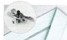
Elasticator Foot Part No. 40131947