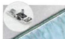
Beading Foot Part No. 40131949